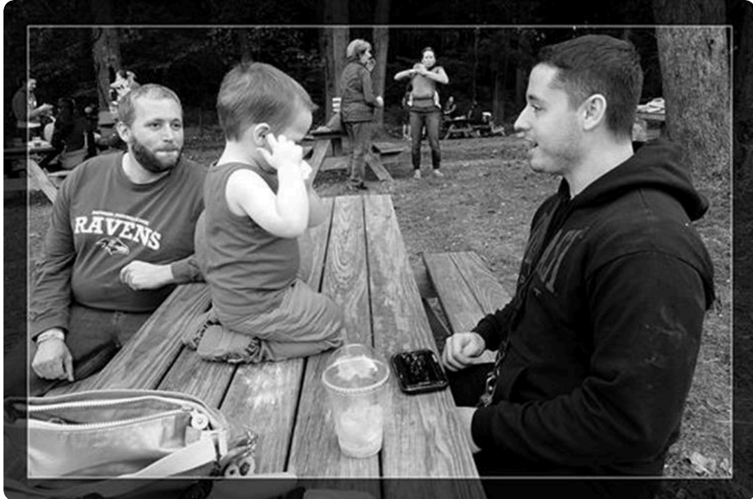
The boys...and a very proud father