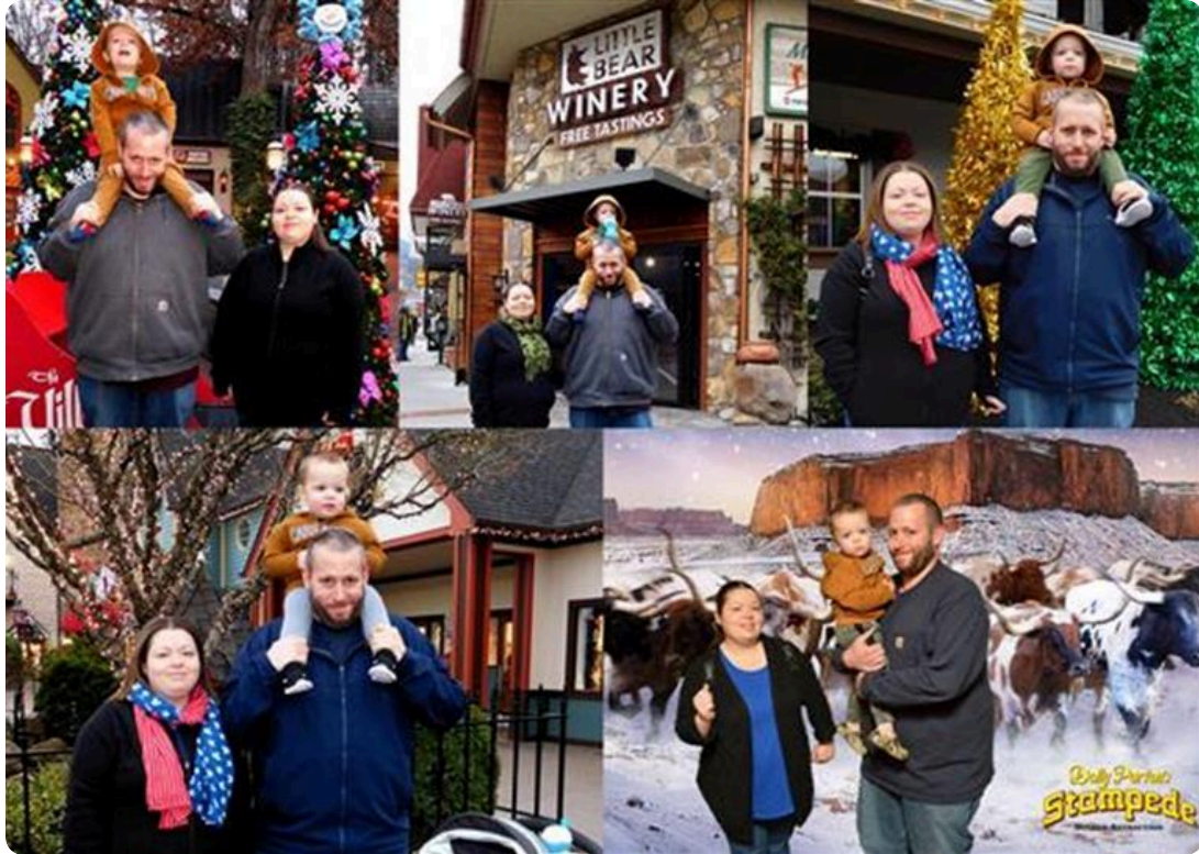
Tennessee Christmas Trip 2019