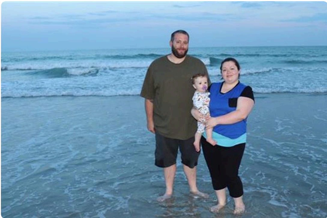
Our beautiful, loved family