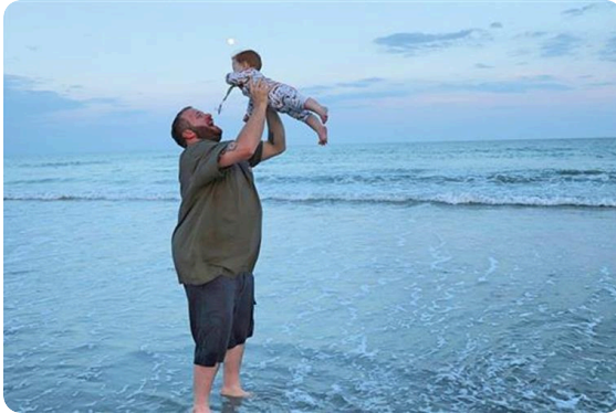
An unbelievably happy and proud father