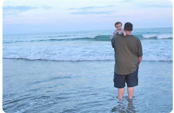
A beautiful, content moment